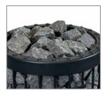
Heater stones, ø 10-15 cm, AC3020