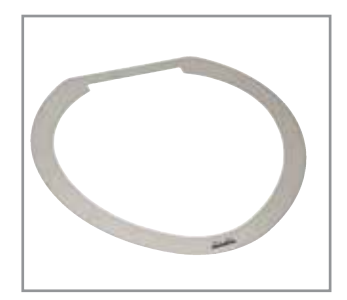
Embedding flange HAF1