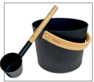
Sauna bucket & ladle set SAC10111

P.O. Box 12 FI-40951 Muurame, FINLAND Tel. +358 207 464 000 harvia@harvia.fi www.harvia.com