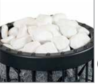
Decorative stones, ø 5-10 cm, AC4000